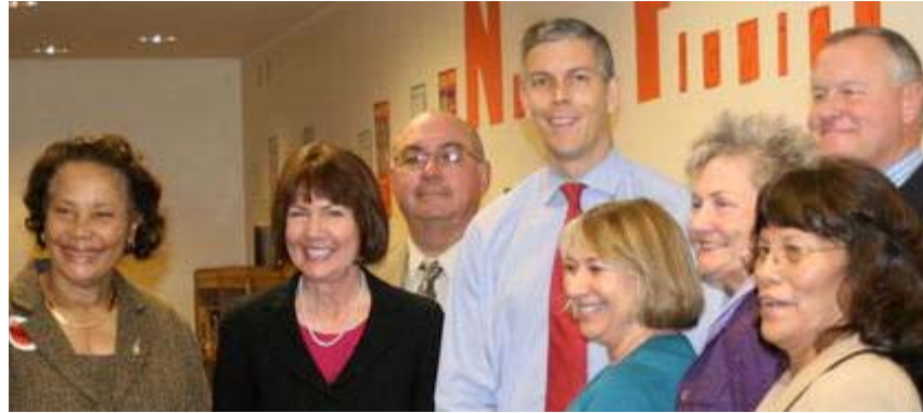
U.S. Secretary of Education Arne Duncan (fourth from left) and U.S. Rep. Ann Kirkpatrick, D-Ariz., (second from left) pose with County Superintendents at a forum in Casa Grande on Monday, Oct. 19, 2009.