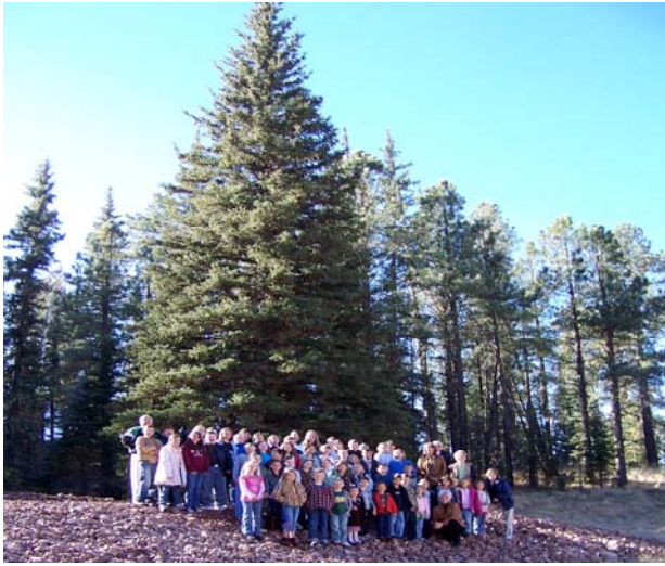
Alpine Elementary District #7 , With Capitol Tree